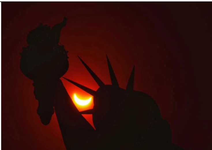
Partial eclipse shines through Statue of Liberty