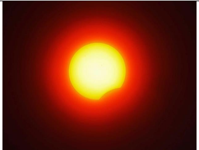
Partial solar eclipse Liberty Island NY