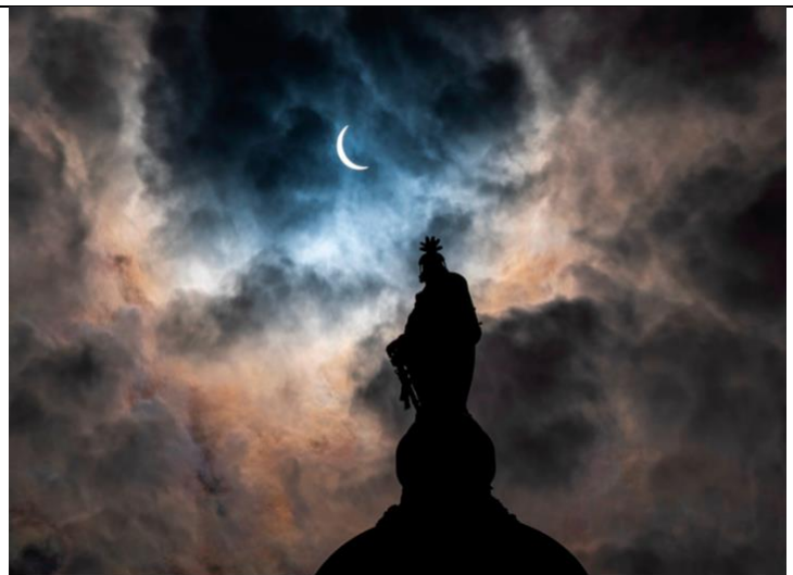
Statue of Freedom on top of US Capitol