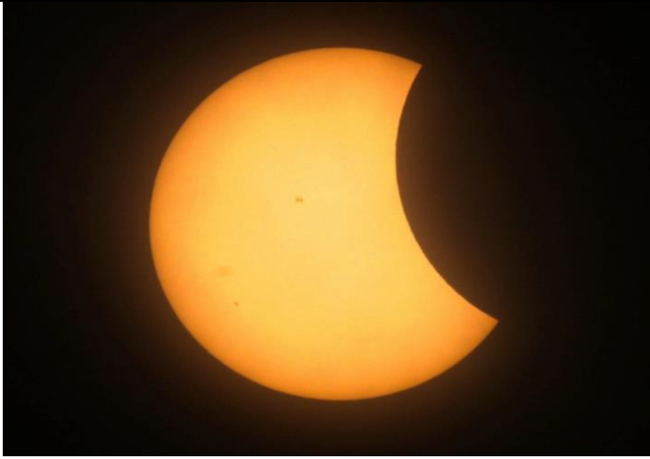
Partial solar eclipse Mazatlan Mexico